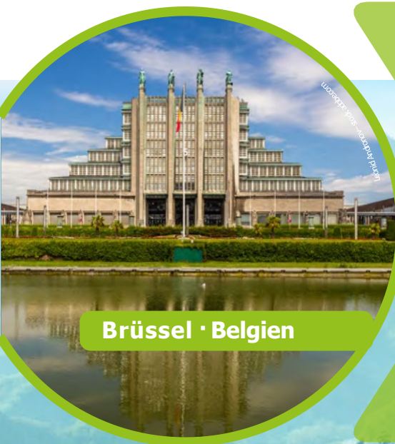
Brüssel · Belgien